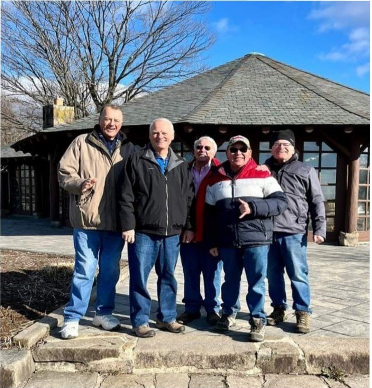
During the “Alpine Hike” hikers dined at the Alpine Lookout Café.